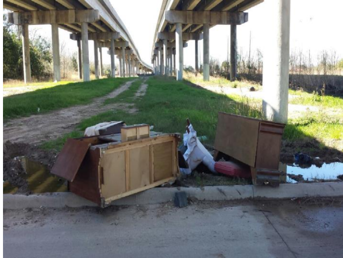
Figure 1: Officer observed trash at Orem St. underpass.